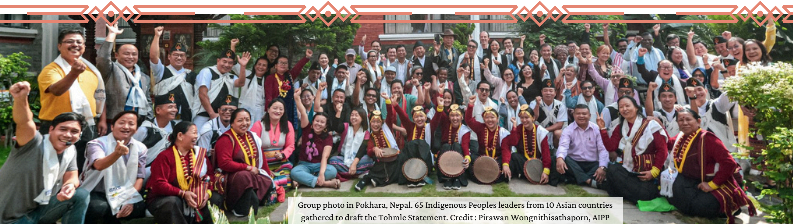
Group photo in Pokhara, Nepal. 65 Indigenous Peoples leaders from 10 Asian countries gathered to draft the Tohmle Statement.

This statement was developed at the 4th Indigenous Knowledge and Peoples of Asia (IKPA) Conference on Indigenous Peoples' Rights, Biodiversity, and Climate Change, held on October 1-4, 2024, in Pokhara, Nepal