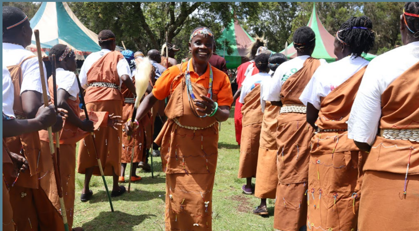
Jubilant Ogiek women celebrating World Indigenous Day 2023, Mt. Elgon, Kenya, November 2023.

In Kenya, the project is designed to build a collaborative framework for supporting the national implementation of the CBD. It will do this through embedding local community and indigenous contributions into national strategies and reporting.