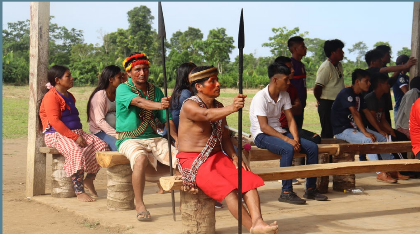
Wampis assembly in Kankaim.

Work in Peru focuses on strengthening indigenous people's initiatives for protecting biodiversity and governing their territories in the Andean-Amazon regions. This includes the application – and documentation – of traditional Andean-Amazonian agroecological approaches and territory-based provisioning systems.