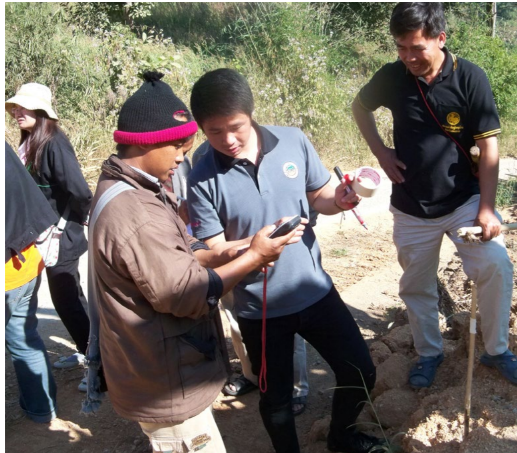
GPS mapping survey, Thailand.

“ The GTANW aims to maintain the potential of biodiversity and important ecosystems through the optimisation of a socio-territorial governance system. ”