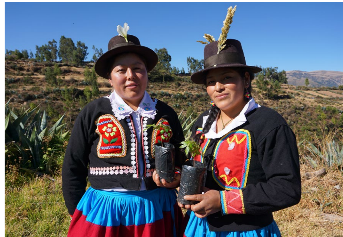
Transformative Pathways project promoters from the Andean Quechua community, Ayacucho, Peru.

FPP is a UK Charity No. 1082158 (and company limited by guarantee in England & Wales, Reg. No 3868836).