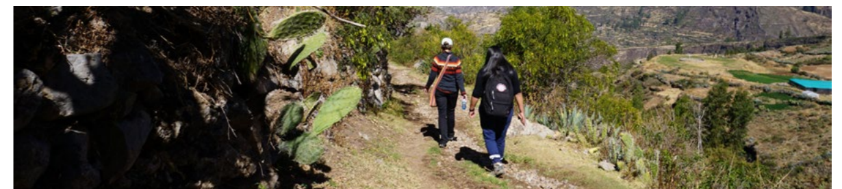
FPP staff visit CHIRAPAQ partners in Ayacucho.