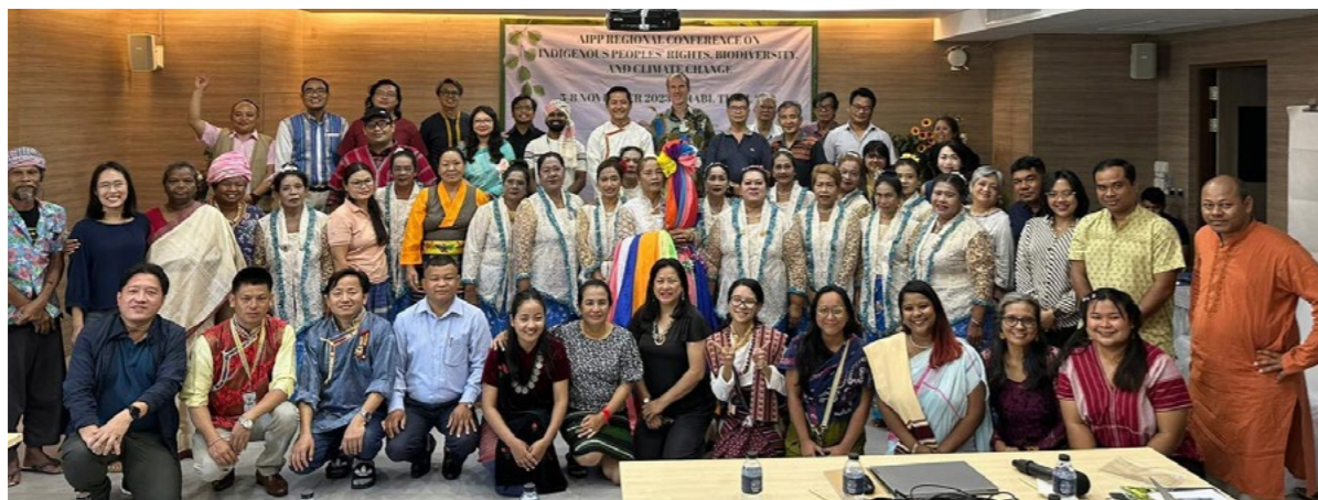
Group photo of the Krabi Conference participants. The Conference participants adopted the E-Sak Ka Ou Declaration. October 2023.