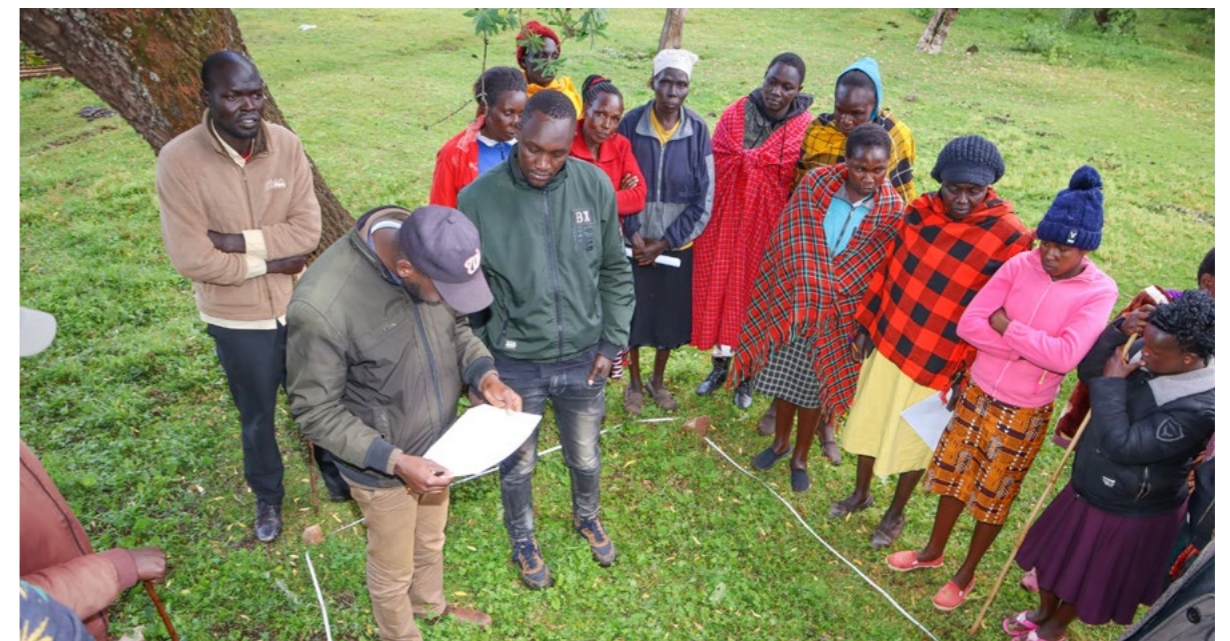
Demonstration on quadrat method of data collection with CIPDP, November 2023.