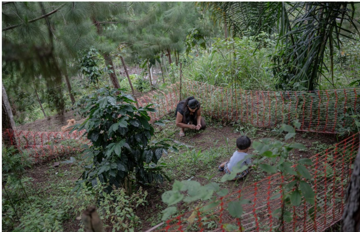
Yanessa people grow vegetables in a family bio-garden. Unión de La Selva Native Community, district of Villa Rica, province of Oxapampa, Pasco region, Peru.