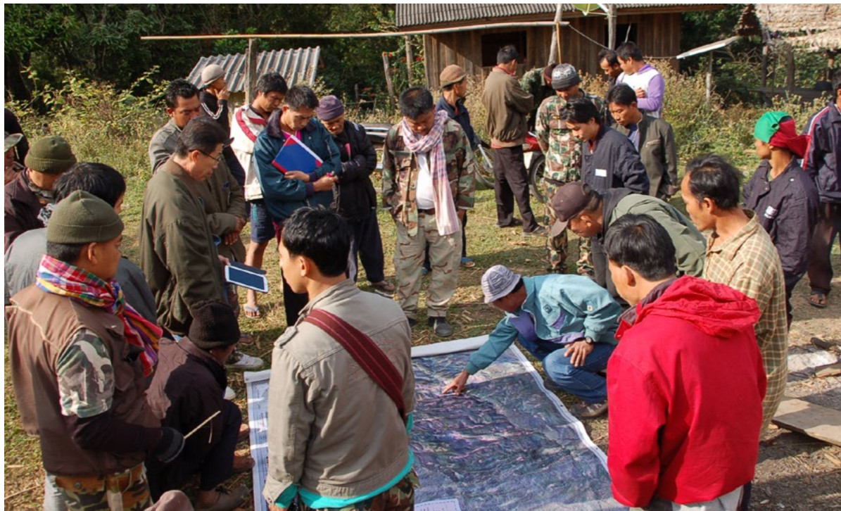
Using Maps to address the issue of Expanding Farming Areas, Thailand.