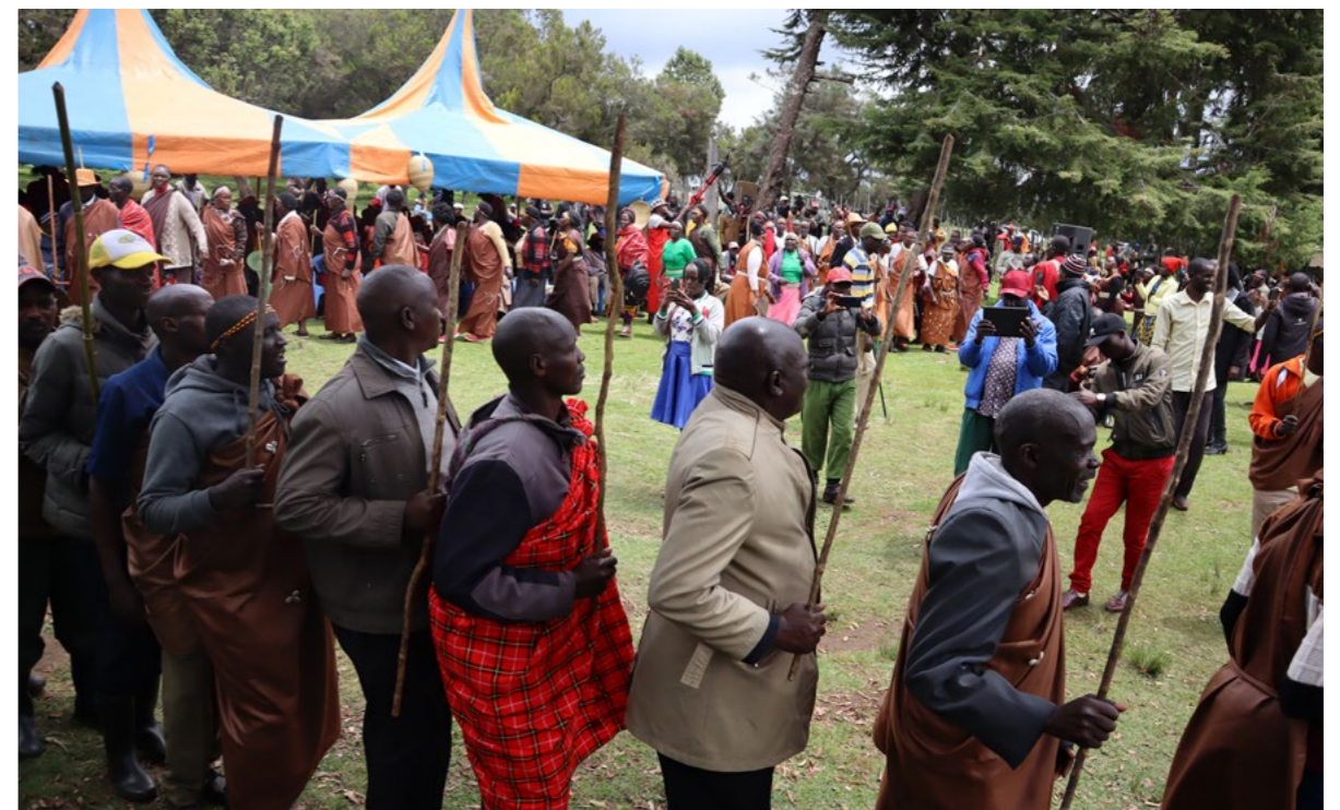
The Ogiek community of Mt. Elgon, Kenya marking World Indigenous Day 2023 with song and dance.

As this action is carefully designed to complement and engage with wider networks, we expect the impacts from project activities to extend well beyond both the project timeframe and the countries involved.