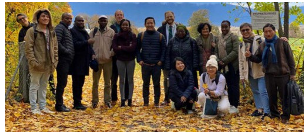
Indigenous Leaders in Geneva before a workshop on the Indigenous Navigator. November 2023.