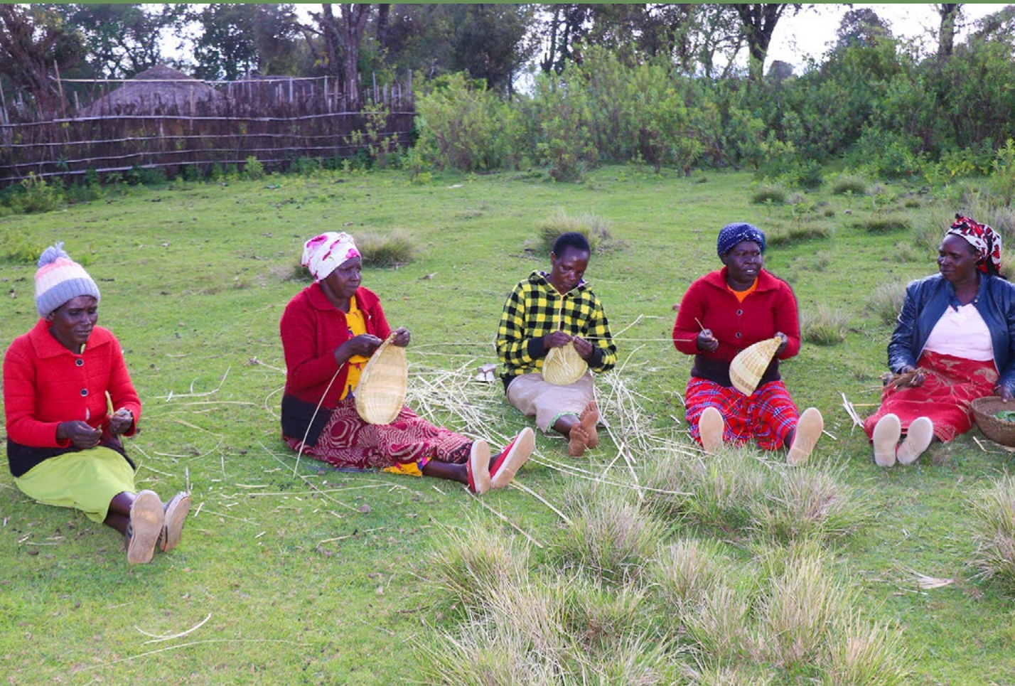
Ogiek women engage in basketry. Bamboo baskets replace use of plastic materials in Chepkitale.

Working with national partners and global collaborators, the project is driving influence in global policy spaces. It targets monitoring and reporting within the CBD and reporting and analysis within IPBES in particular to embed the contributions of IPs and LCs within these processes.