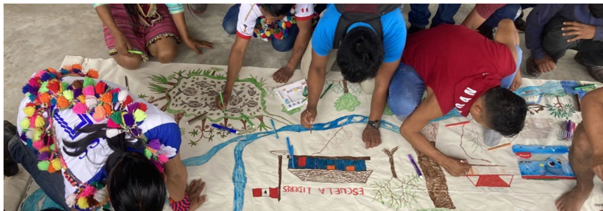
Students drawing the learnings from their leadership training, one of 5 run over a year by LifeMosaic for the Shawi Leadership School in Peru.