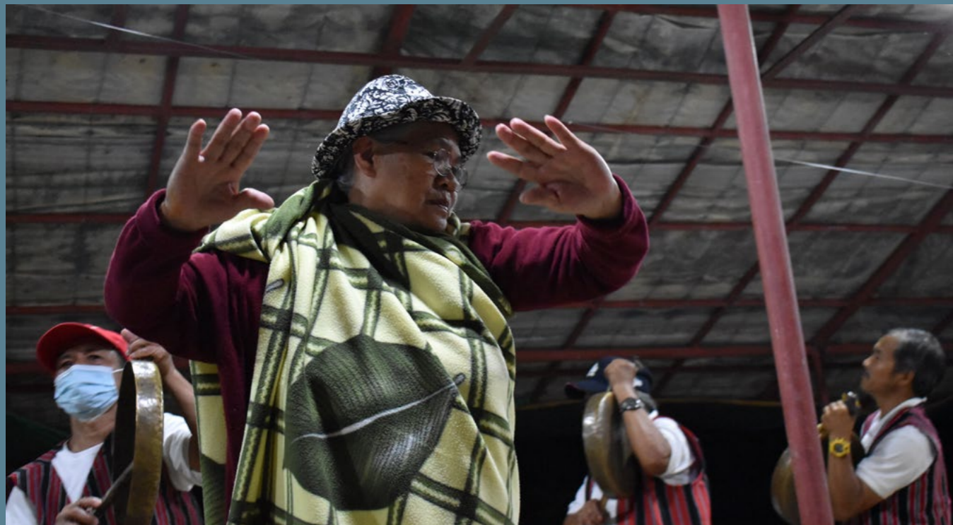
An Ibaloy elder performs a traditional dance with Ikalahan community members during a cultural celebration held in Nueva Vizcaya, Philippines.

Activities in the Philippines focus on community-based learning, intergenerational transmission of knowledge and indigenisation of education across five key workstreams: food systems and traditional livelihoods; health and well-being; youth leadership; indigenous voices in arts and literature; and national and international engagement and policy advocacy.