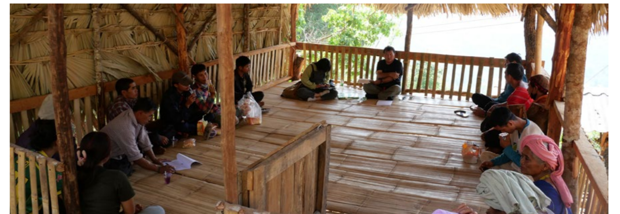
Baan Pa Kluai Project Meeting.