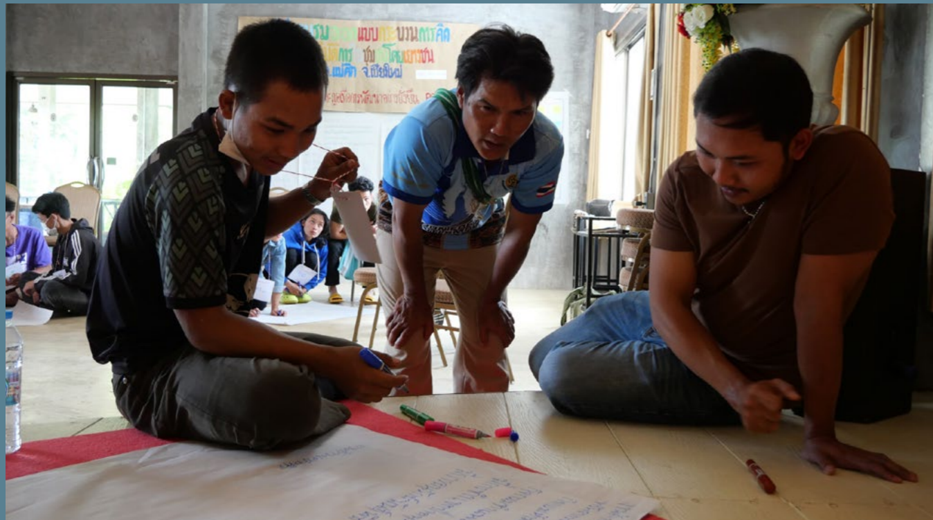
Brainstorming session on resource management in the community.

Work in Thailand focuses on generating diverse models of sustainable biodiversity management. This is based on dynamic interaction between traditional knowledge and innovative agroecological approaches.