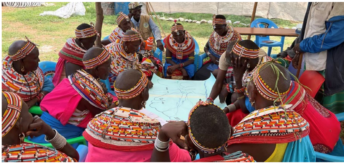
Samburu Indigenous Peoples doing Community Resource Mapping at Kiltamany.